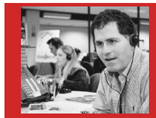
Micheal Dell Dell Computers