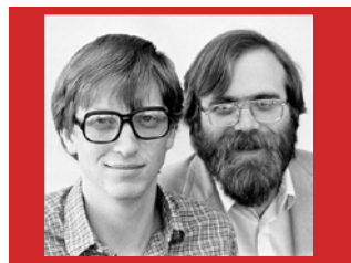
Bill Gates & Paul Allen Microsoft

Image 1 lists successful entrepreneurs. All these people started their enterprise while they were in their 20s!