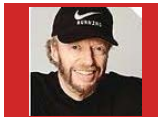
Phil Knight Nike