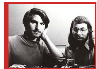
Steve Jobs & Steve Wozniak Apple Computers