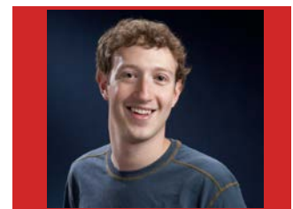
Mark Zuckerberg Facebook